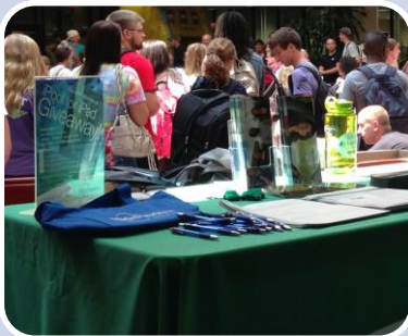
Rideshare Fairs and Lunch & Learns