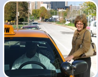
Guaranteed Ride Home