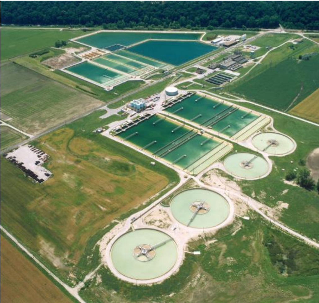
St. Louis County's Central Water Treatment Plant